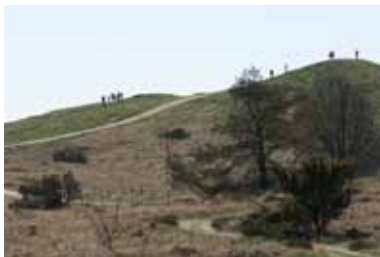
In the National Park “Mols Bjerge” the riders will visit some scenic views as fx the ancient iron-age tombs “Tre-høje”.

Along the tracks the riders will visit many lakes.