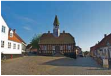
The old townhall in the city Ebeltoft just 10 km from the showground.

The riders will ride along the shore on the half-island Helgenæs. Helgenæs is known for its richness in beautiful views.