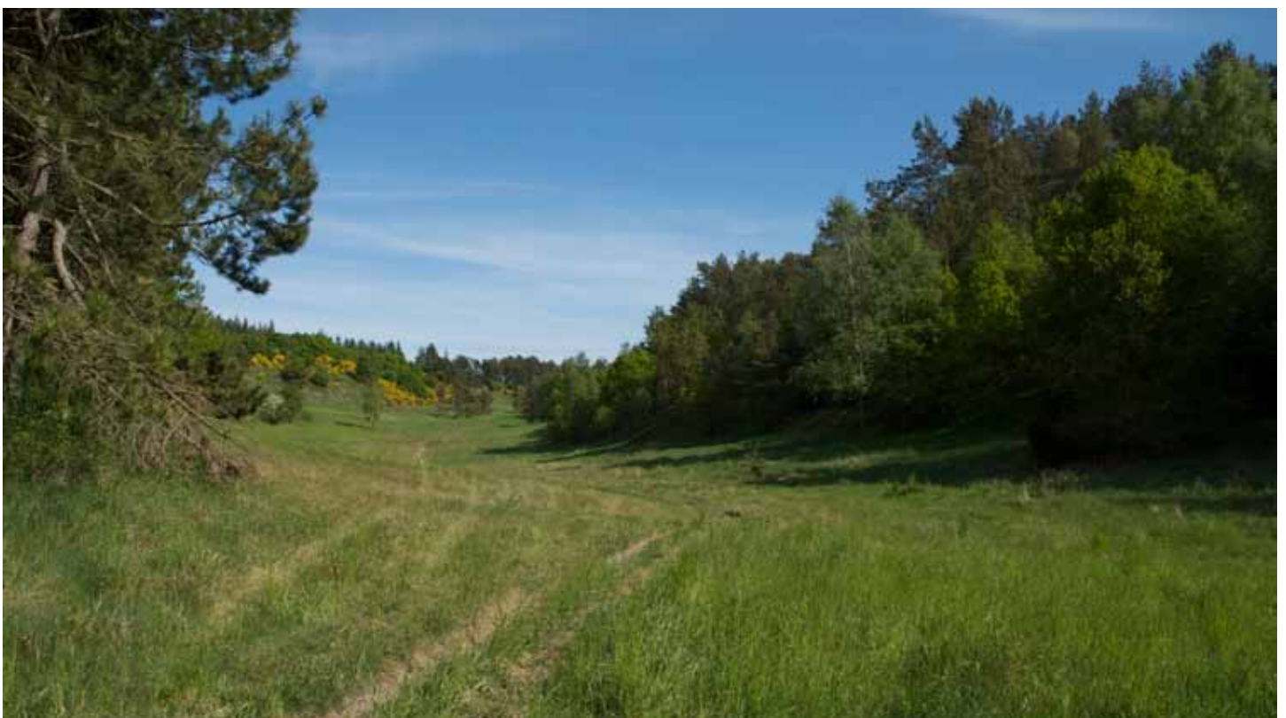
Old meltwatter plains with kettel holes

We also have a desire to develop endurance riding in Scandinavia and especially in Denmark. Denmark is well-known in both Jumping and Dressage as competitor but regarding endurance a small but potential country. We hope that Molsridtet will contribute further to the dissemination and development of the sport beyond the current frontier.